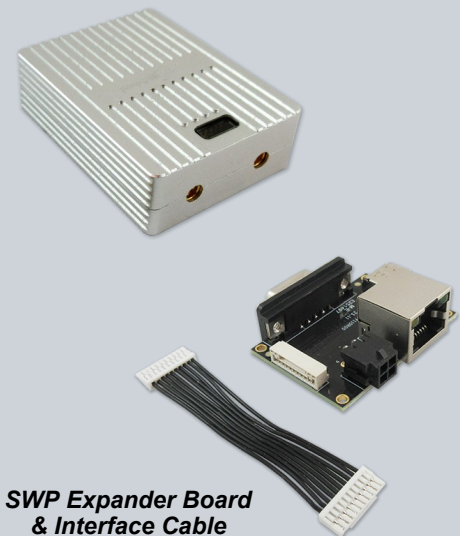
SWP Expander Board & Interface Cable