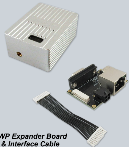
SWP Expander Board & Interface Cable